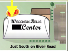
Wisconsin Dells Center Just South on River Road

River Road Scenic Route to Downtown Wisc. Dells